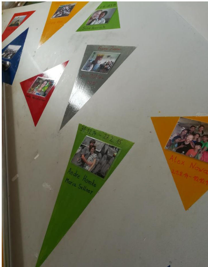
Ancestral wall in the hallway of the school