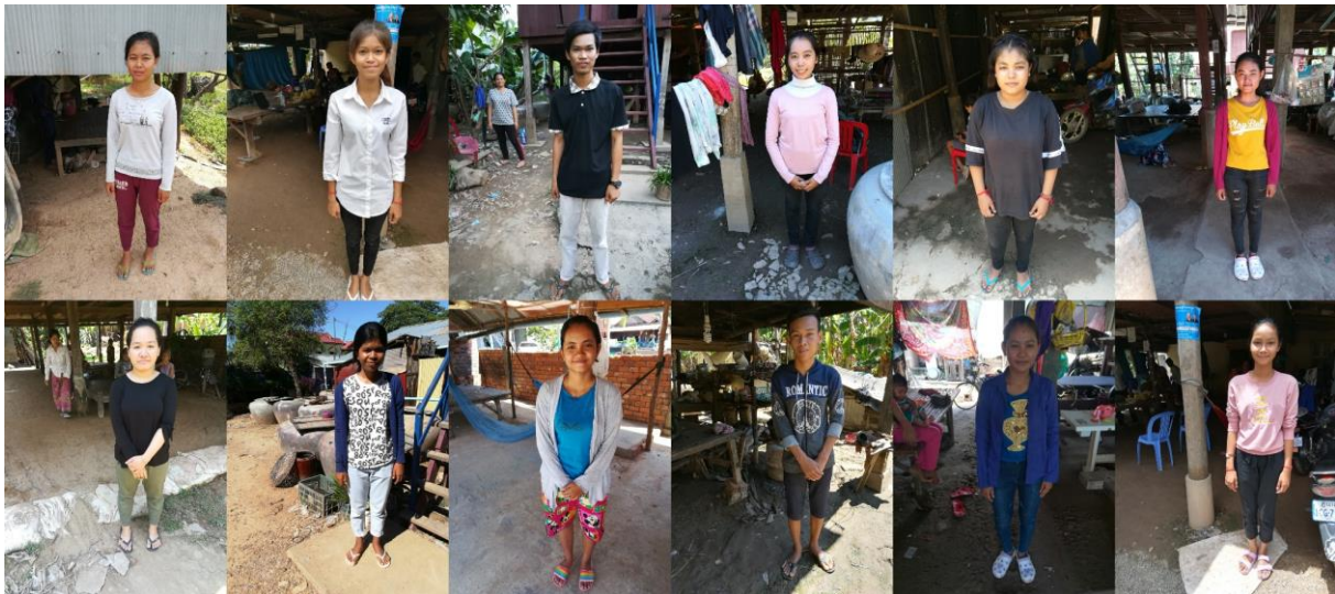
Meanwhile all are already enrolled - The new students 2018

We were once again impressed by how many sponsors contacted us in a very short amount of time and how quickly our new students found sponsors. On behalf of all scholarship holders of the new year, we would like to take this opportunity to express our sincere thanks. Meanwhile all of them are already enrolled and begin to learn what it means to live and self-organize, far away from their family. In autumn/winter next year we will send the first reports about their development.