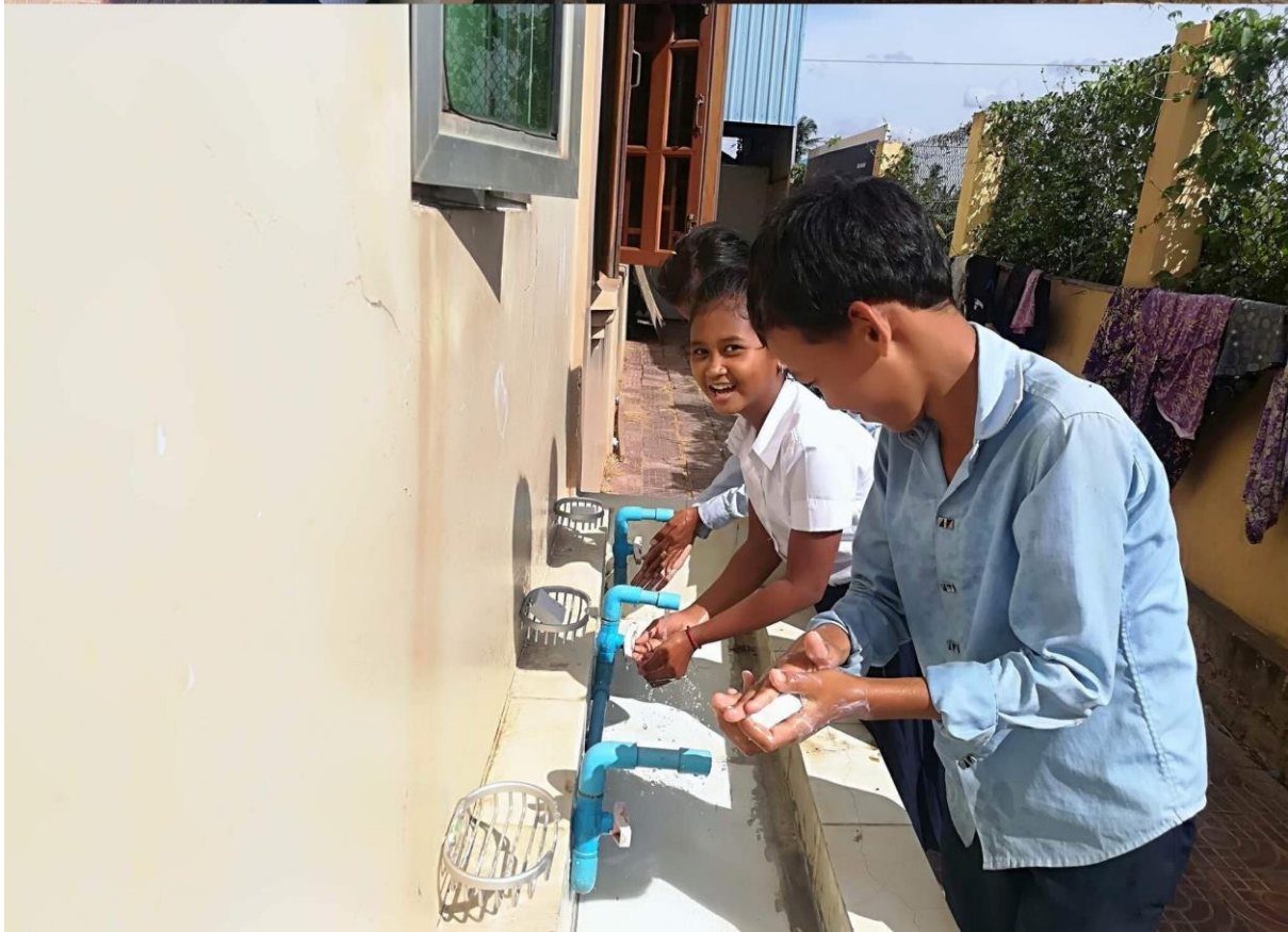
During planning (top left) / the new filters (top right) / children at the new washbasin (bottom)