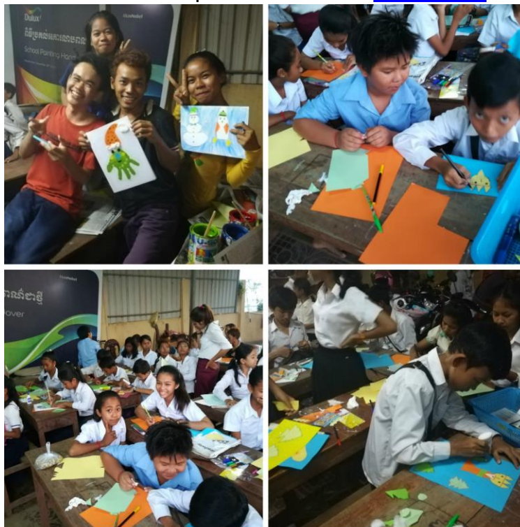
Fig. 3: Snapshots of the Christmas card handicraft workshop

If you order cards from us now, they will arrive in time for Christmas. You can find more information about the purchase on our homepage .