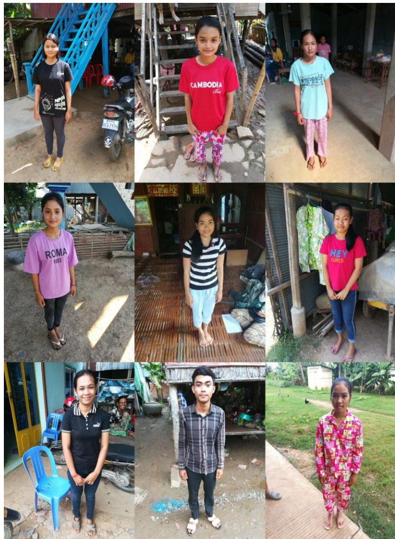
Fig. 1: Scholarship holders 2019/2020

Every year we ask ourselves whether it is realistic to find sponsors for the increasingly expensive studies here and we are always surprised by your readiness to help. Especially in times when populists all over the world try to maintain or even increase the division between rich and poor by building walls in their heads and at various border crossings, we are happy to see how many of you want to contribute to overcoming the injustices in the system.