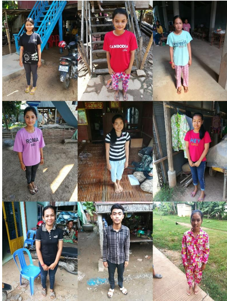
Figure 3: Gallery of students who successfully applied for a Kidshep scholarship in 2019

The first study counselling session for pupils of the eleventh and twelfth grades took place on Saturday 10 October. In addition to an introduction to the application process by our school principal Khemara, two of our current scholarship holders spoke to the potential applicants. The purpose of these presentations is to prepare the participants for life as a student. Many of them only know a few subjects and universities. Our study counselling sessions are meant to not only show them the options they have, but also make clear what they have to research over the next few weeks.