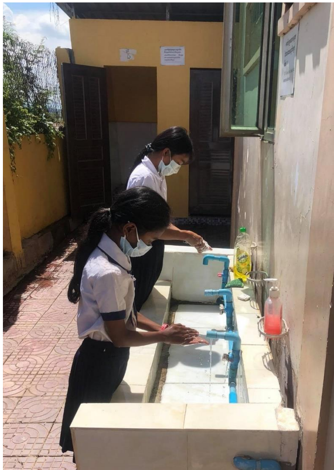
Figure 1: Schoolgirls washing their hands at the outdoor washbasins

Of course, strict rules on distance and hygiene still apply. Operations cannot take place as they did before the pandemic. Because of the distance rules, for example, classes were divided into two and now come to school on alternate days. This is