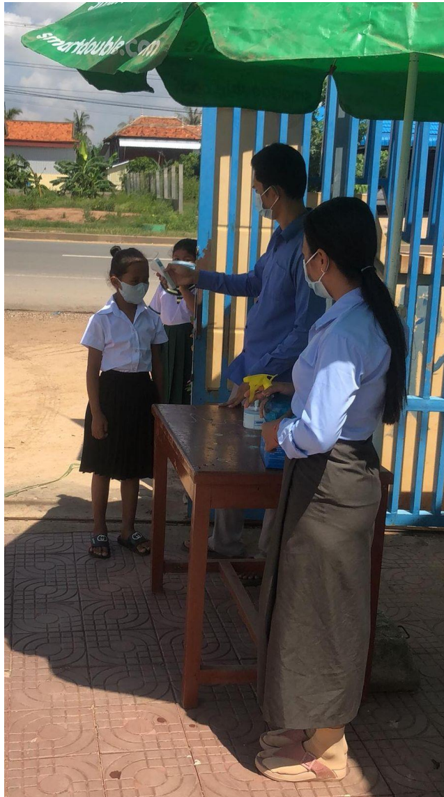
Figure 2: A pupil during a COVID-19 -19 related health check at the school gate

of the supporters of the English school , no child has to pay school fees with us at the moment. State schools are also free. However, it is still common practice for teachers to offer so-called tutoring hours. These cost money and it is often very difficult to get good grades if a child does not attend them. In addition, every student needs at least a few dollars per month for school materials and food. We are therefore still in urgent need of new sponsors. If you or your company can