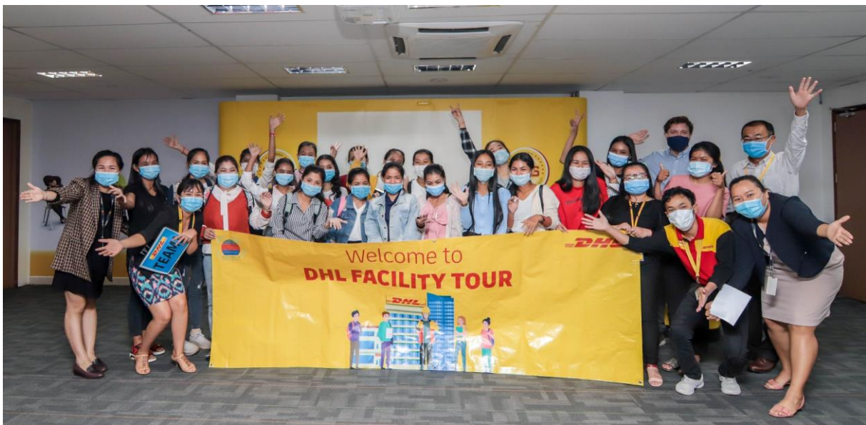
Figure 1: Our students on this year's DHL Express Cambodia Facility Tour 1

Having provided updates on the progress of our projects in the last newsletter , we would like to focus once again on the general situation here in the country as we approach end of the year. Why? Simply because we receive regular requests wanting to know how your godchildren and the people in Cambodia are doing.