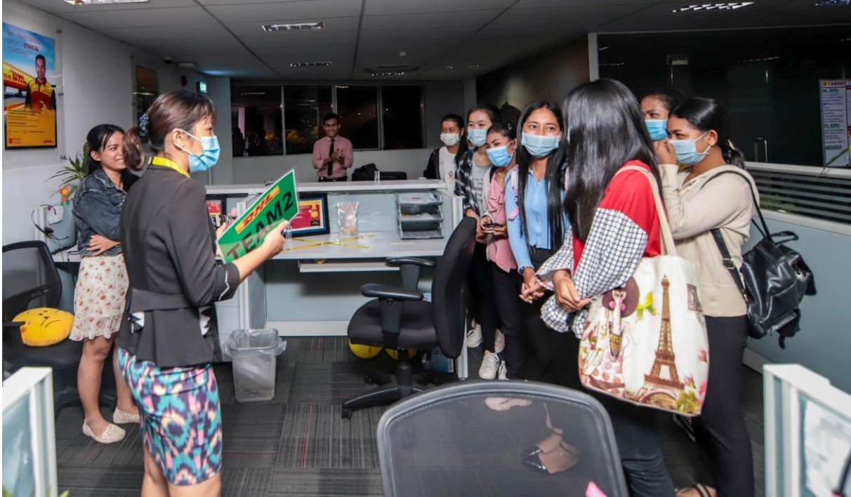
Figure 2: Some of our scholarship holders with the Head of Human Resources of DHL Express Cambodia

not be able to present the candidates until February at the earliest. We will then share their profiles with you as usual via special newsletters and Facebook .