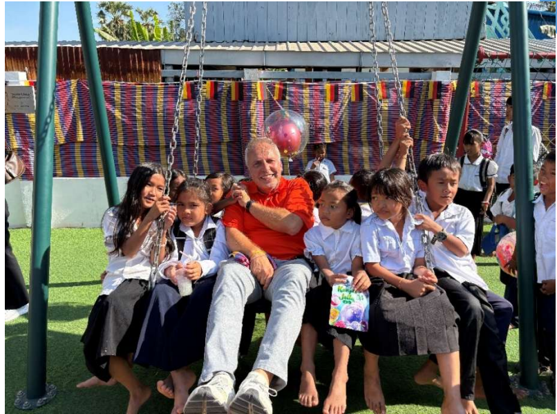
Inauguration of the swing, which is used extensively by children from the neighborhood and school

We would like to thank all of the sponsors who made this project possible. The children in Cambodia will benefit from this school just as many before them have benefited from the KKS, which has been in operation since the end of 2010 – whether it be through improving their English skills enough to get a better job or even a place at university.