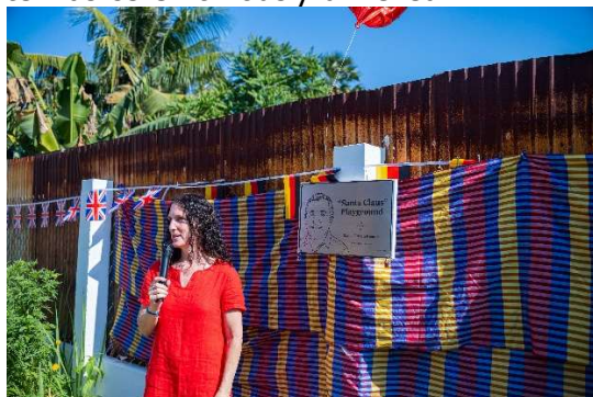
Ceremonial unveiling of the sign