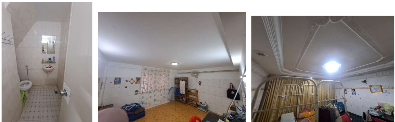
Renovated bathroom and rooms in the female student residence

The meeting with the alumni and the student party in the dormitory were opportunities to meet all current students and to learn of progress of our alumni group. Since the student party in the dormitory, we are also pleased that all bedrooms, bathrooms and kitchens have been inspected and refurbished where necessary.