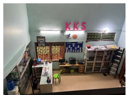
New entrance area at Khemara Kidshelp School