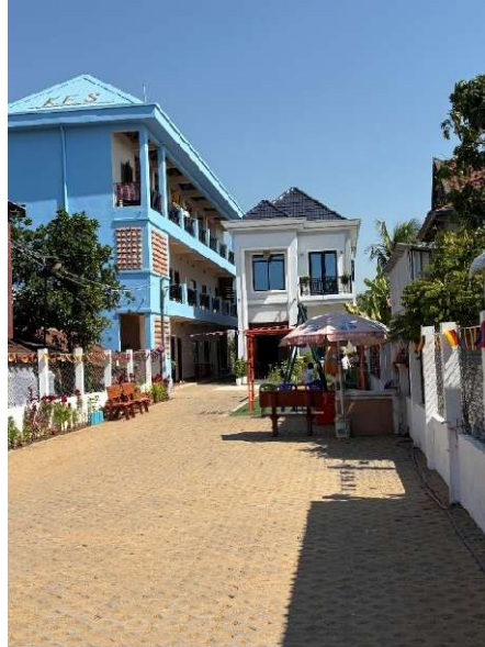
Entrance gate to the new English school New Englishschool - KES

After the Ground Breaking Ceremony on September 13, 2024, construction began, and the building was handed over as early as May 27, 2025. The contractually agreed costs and milestones were met, and individual construction phases were even completed earlier than planned.